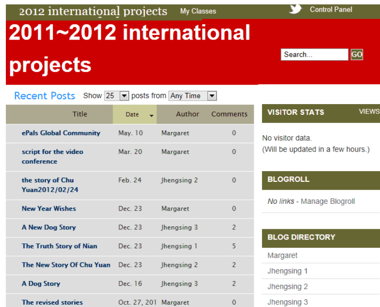
Figure 2. Screenshot of the class weblog

A class weblog (see Figure 2) was set up to facilitate teaching and learning in the course. The blog contained a collection of information and learning resources that gave step-by-step support to students as they completed their project tasks. Each group had its own individual blog within the class blog in which students wrote their project drafts and did peer-corrections. The researcher also answered students' questions and commented on students' work through the class weblog.