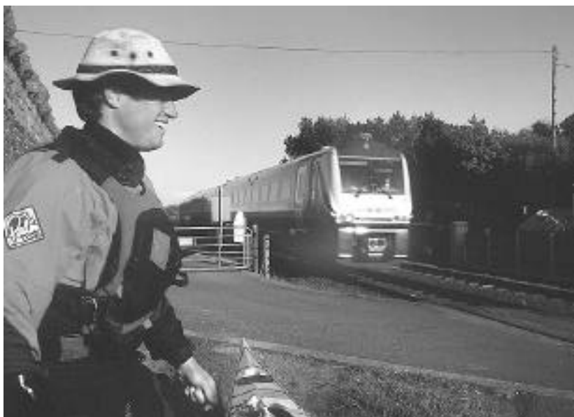
Kayakers in training!

In the next article, wind, rain, and an epic off the west coast of Skye.