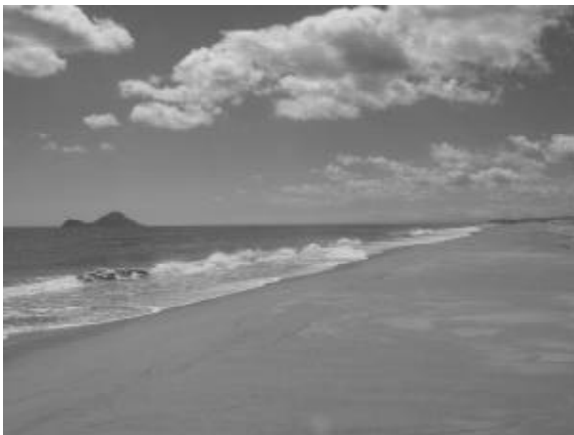
Long, long beaches in the Bay of Plenty. Whale Island on the horizon.

The first view again of Lake Te Anau quickly dissolved any worries we may have had of being caught in wind. The reflections of boats and mountains on the lake provided real picture post cards type shots. We knew we had plenty of time to get across Te Anau so we were all in cruise mode enjoying everything around us, the intense silence with only the sound of paddles hitting the water, and the privileged feeling of being able to be in such a wonderful place. It all finished too soon. It was then time to unload boats, get off the smelly gear and drive back to Dunedin.