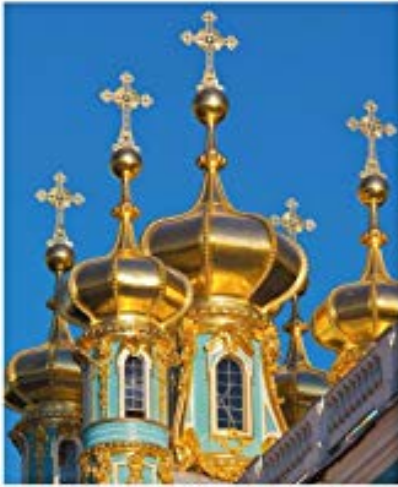
The guides that show you what others only tell you

Preview and Read By DK Dk Eyewitness Travel Guide St Petersburg , the best book and very sought after book, This Book/PDF in the market store is sold at prices but here you can read for free and you can also read all of our latest book collections. Which certainly updates every day.