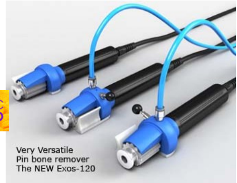
Very Versatile Pin bone remover The NEW Exos-120