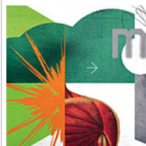
Heart Helper May Come at a Price for the Brain

The American Preoccupation With Russia Room for Debate asks: Should the U.S. worry less about its cold war rival, and more about rising powers?