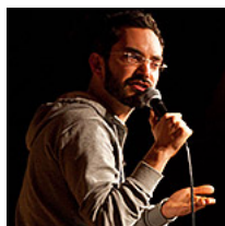
A Stand-Up Joke Is Born