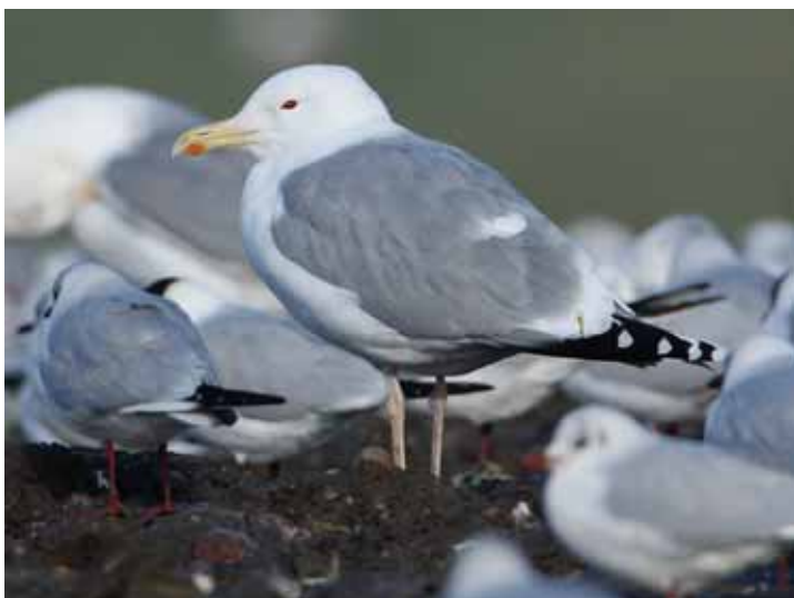
87. Adult Caspian Gull, Essex, 7 Feb 2009. This bird's eye is at the dark end of the range.