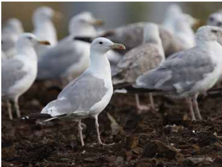
86. Adult Caspian Gull (centre left) with Herring Gulls, Latvia, 14 Aug 2008. This photograph allows direct comparison of jizz, bare-part colours and grey tones of the two species.