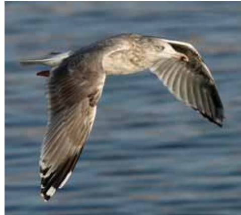
83. 3CY (3W) Herring Gull, North-east Scotland, 2 Nov 2008. This bird shows an extensive brown wash to its wings, a well-streaked head, has only limited black on P5 and (already) a very pale eye. Individually and collectively, these features make confusion with cachinnans unlikely. 3W argenteus Herring Gulls regularly show a complete, deep black band across P5, unlike this argentatus , which has isolated dark smudges. So, the presence of a black band on P5 is not a key feature at this age. Note that P10 is not yet fully grown.