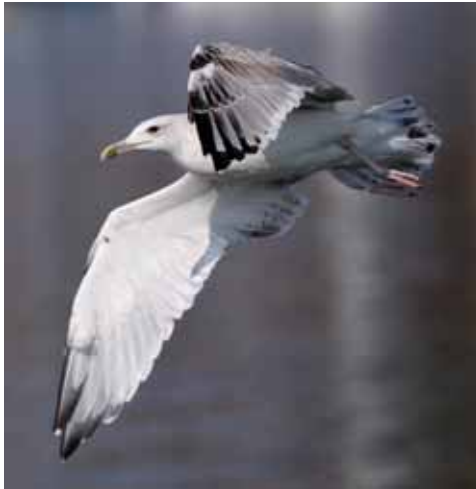
82. 3CY (3W) Caspian Gull, Lithuania, 10 Sep 2009. The primary pattern of this bird is beginning to take on some of the features of adults – note the grey tongues eating into the black wing-tip. The outer primary coverts and the alula retain extensive, blackish-brown marks.