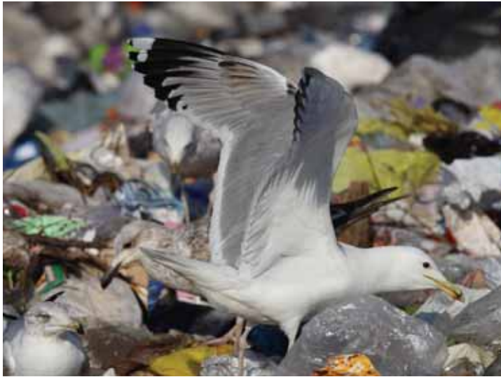
85. 5CY (4W) Caspian Gull, Latvia, 13 Apr 2009. The extensive dark areas on the primary coverts, dark grey wash on the outer webs of P5–P7 and the black band across the tip of P10 suggest that this is not a fully adult bird.