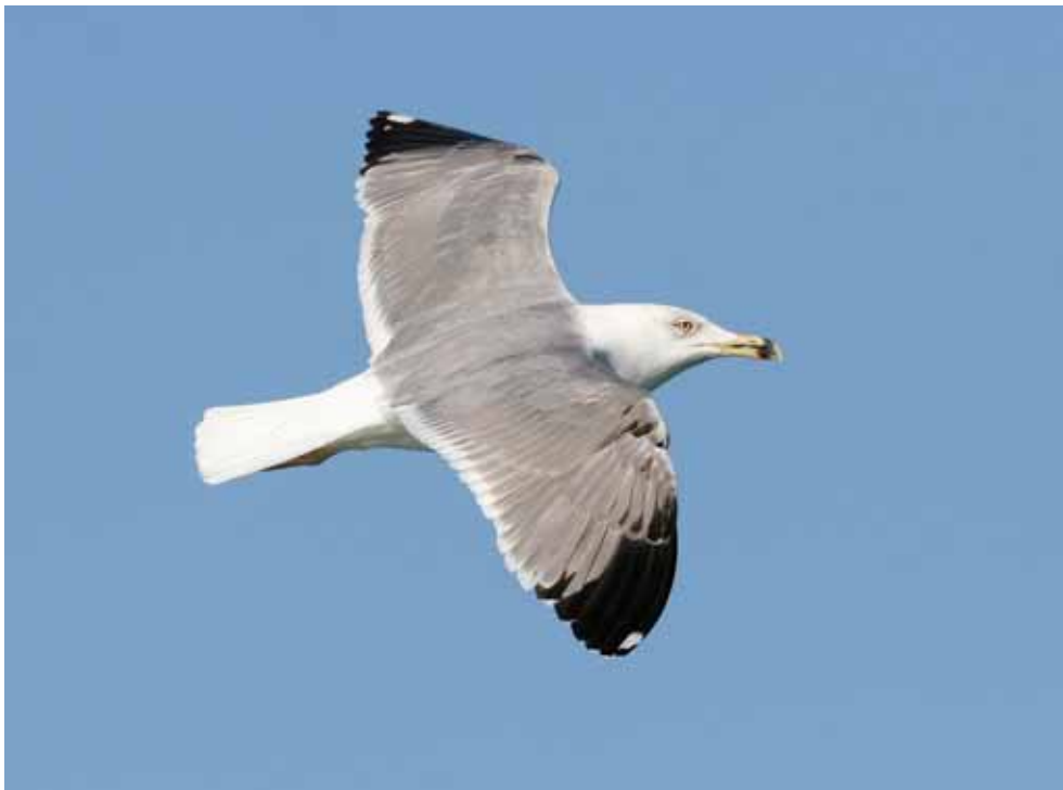
84. 3CY (3W) Yellow-legged Gull, Spain, December 2006. Birds of this age are variable. This one has a rather large mirror in P10 but on others it is much smaller or even lacking. It has a clean white tail but many retain vestigial dark marks. The extensive blackish-brown primary coverts contrast with the otherwise grey upperwing. The black of the primaries forms a solid wedge on the outer wing. Note the asymmetrical wing-tip pattern – there is a mirror on P9 on the left wing but not the right wing. Such asymmetry is not unusual in gulls; consequently, where a particular feature is critical for identification, it is always worth making sure that both wings have the correct pattern.