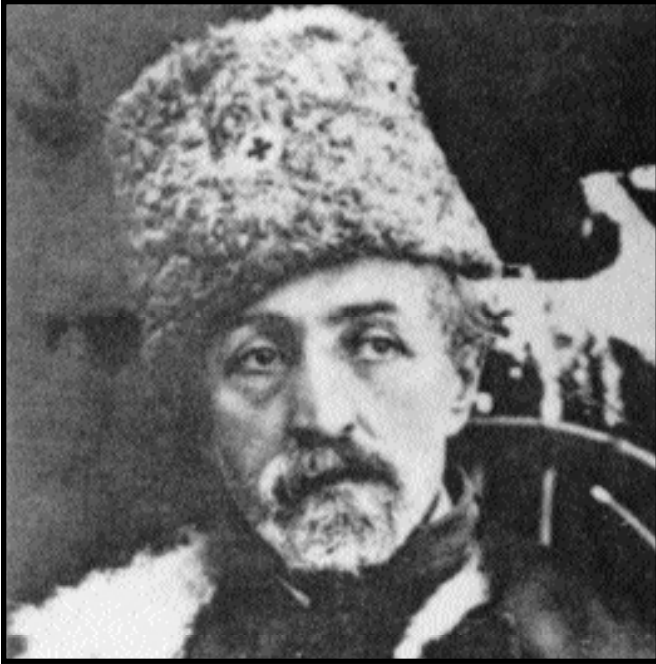
Playwright S. Ansky

1895 - Cuba fights Spain for its independence. William Roentgen discovers the x-ray. The British begin to use gas for heating, lighting and cooking.