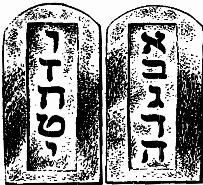
Tablets with the Ten Commandments recall God's covenant with Israel

Hasidic masters who considered it a duty of the highest order to alleviate their people's sufferings. In the Hasidic court, the wealthy were instructed to help their poorer brethren, they learned not look down on their untutored fellows. The unity of the Jewish people and the need for Jews to participate in one another's joys and sorrows was repeatedly stressed. Through their community, Hasidism found in life not only comfort but also the "holy spark" of God present in all living things.