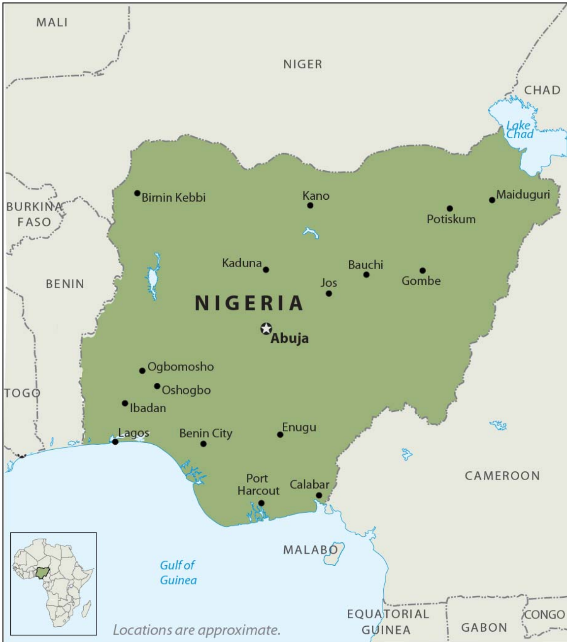
Figure 2. Map of Nigeria