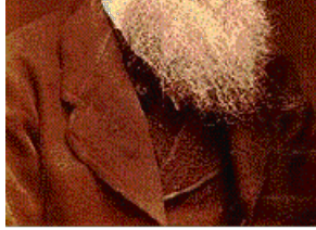
Ch. Darwin Hand-drawn 1874.

Links to our Past News of the Present Insight for the Future