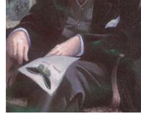
Alfred R. Wallace

Links to our Past News of the Present Insight for the Future