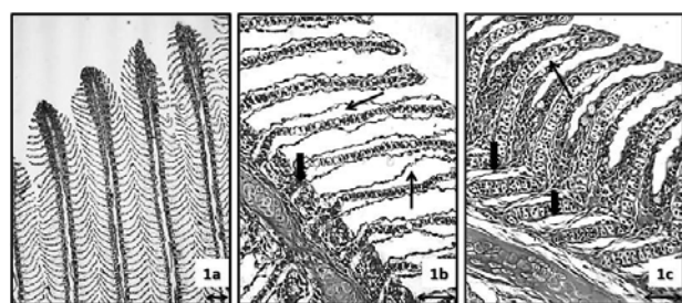
Fig. 1. Representative light microphotographs of common carp gills ( Cyprinus carpio L.) from Topolnitsa Reservoir (b, c). Intense lamellar epithelium lifting (thin arrows); epithelium interstitial oedema (thick arrows); stained with H&E (Magn. x 100, 200, 200)

The concentrations of trace metals in fish gills are also given in Table 1. Since average values for the trace metal concentrations were presented, the bio-concentration factor was not determined. However, it is clear that the metal concentrations were many times higher in the gills than in the water.