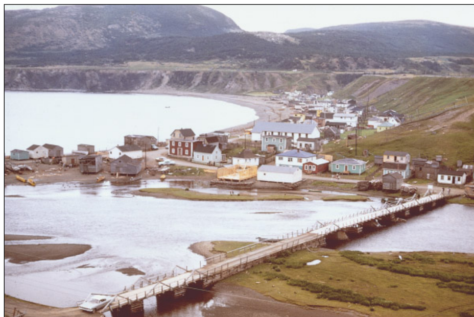
Figure 1. Western Brook Pond in Gros Morne National Park, Newfoundland, a popular location for boat tours. Frequent rock falls and slides occur along the 650-m-high cliffs. What is the rate of slope failure and mass movement, and how does this affect lake levels and water quality in this oligotrophic pond?

By including measures of past environmental change, such as coral growth rings and sediment sequence and compo-