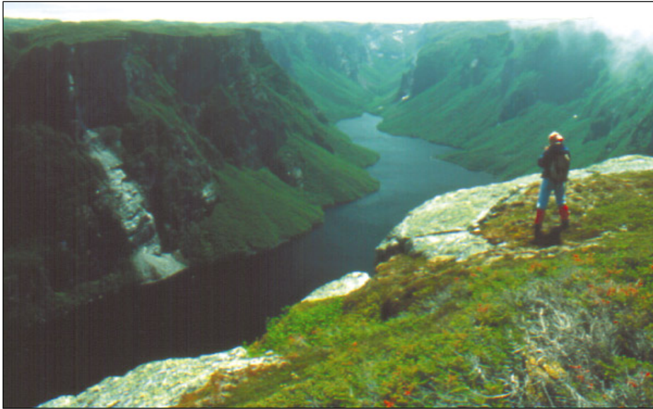
Figure 2. A coastal community where monitoring of geoinicators could assist planning. To what extent are the river channel and its streamflow and sediment load liable to change? The shoreline position has certainly been affected by postglacial adjustments (note the raised terraces). How fixed is it? How stable are the slopes above the settlement and the cliffs along the shore? Photo of Trout River, Newfoundland, by D. R. Grant, 1969.

sition, geoinicators help to emphasize the importance of the geological archive for ecosystem monitoring. This task is easier now that paleoenvironments can be deduced from ice cores, lake sediments, speleothems, and other proxies with the kind of resolution that is useful for assessing short-term changes. As Shen (1996) pointed out, such geoinicators can function as inexpensive automatic field data stations, whose record can be collected from time to time and “played back” to extract information on environmental change.