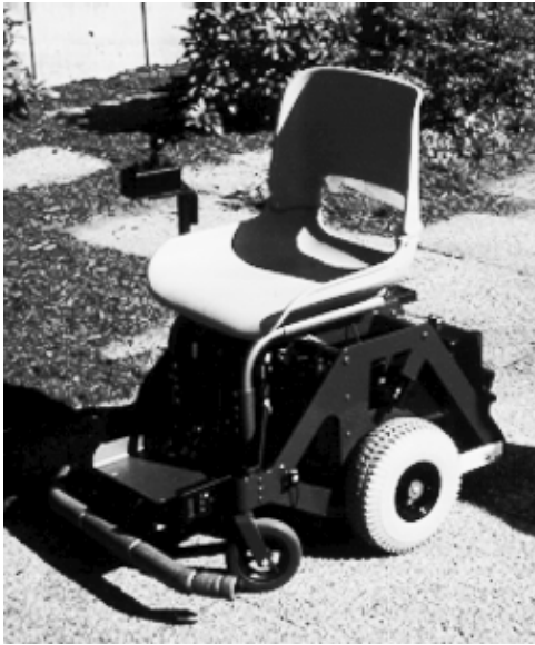
Figure 3 Wheesley , the robotic wheelchair system.

higher tolerance for tight spaces. To return to the primary interface screen, the user clicks on the "return" button in the lower right hand corner of the specialized environment region.