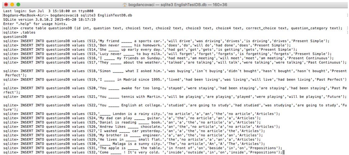
Fig. 2. SQLite for IOS console

required to be done prior (e.g. database needs to be created in a console mode – presented in the Fig. 2).