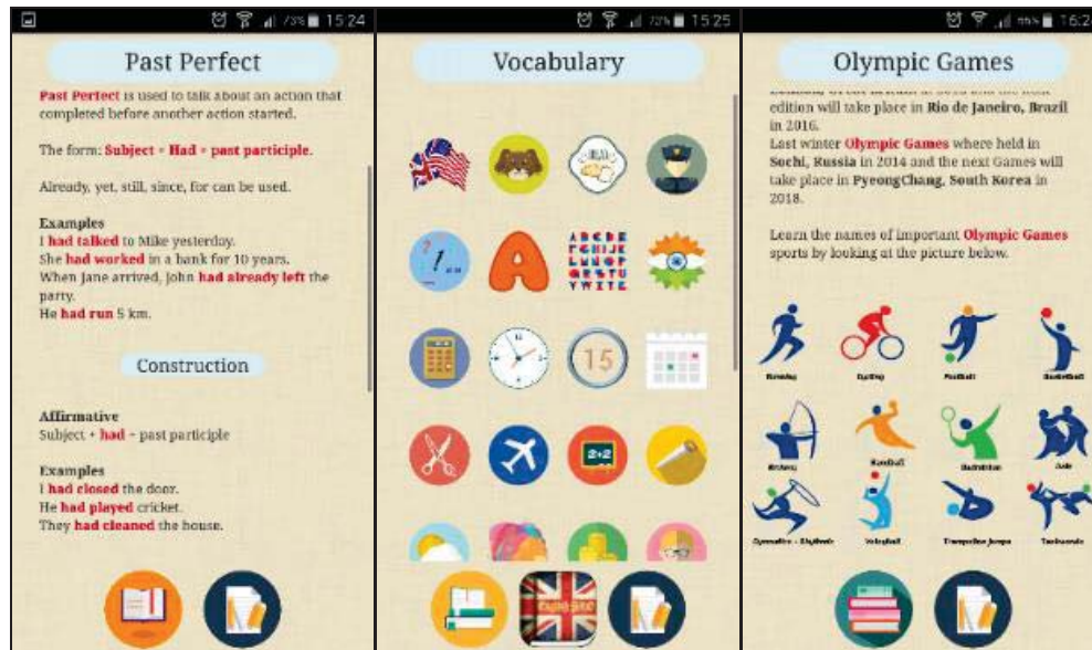
Fig.3 English Grammar Learn & Test app presentation layer samples

The most important part of the Presentation Layer, in this specific case of Mobile app is to insure the scalability for the entire range of devices (smartphones and tablets). As a solution for this part, we treated separately smartphones and their standards.